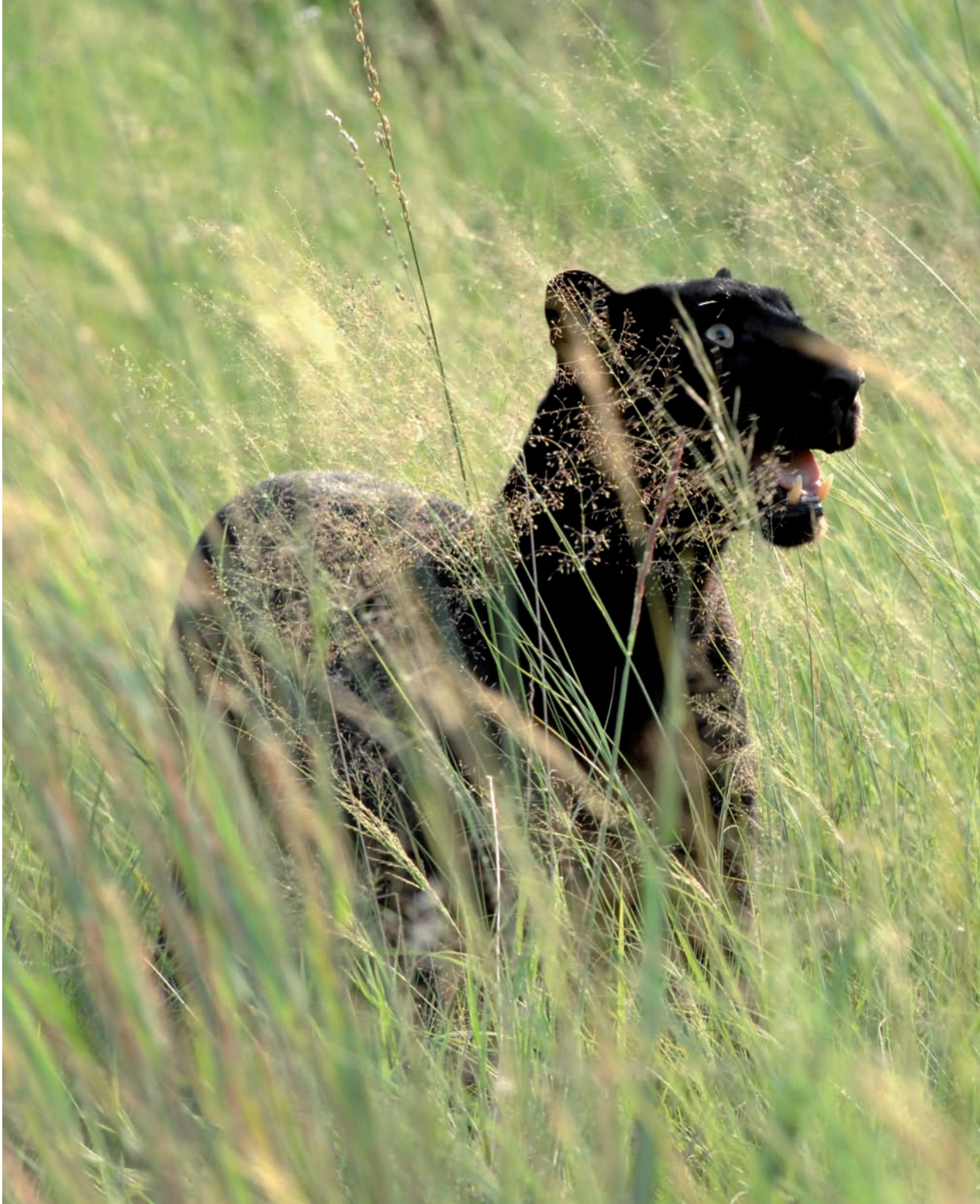
A black leopard keeps to cover in its large enclosure in Africa.