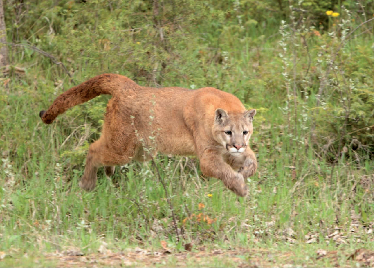
The puma or mountain lion at home in Montana, US. The photo was taken in a large habitat enclosure.